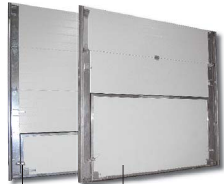
24" high BreakFree bottom section

Note: For more information, please consult the Hardware - Thermostop Industrial Doors and the Operators - Thermostop Industrial Doors brochures.