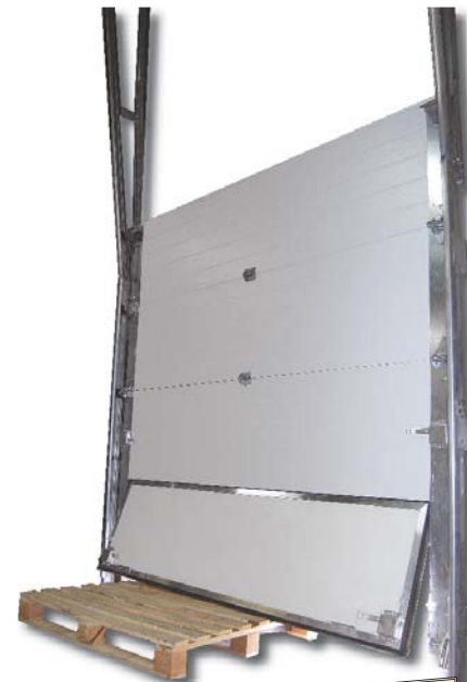
BreakFree door hit from the outside