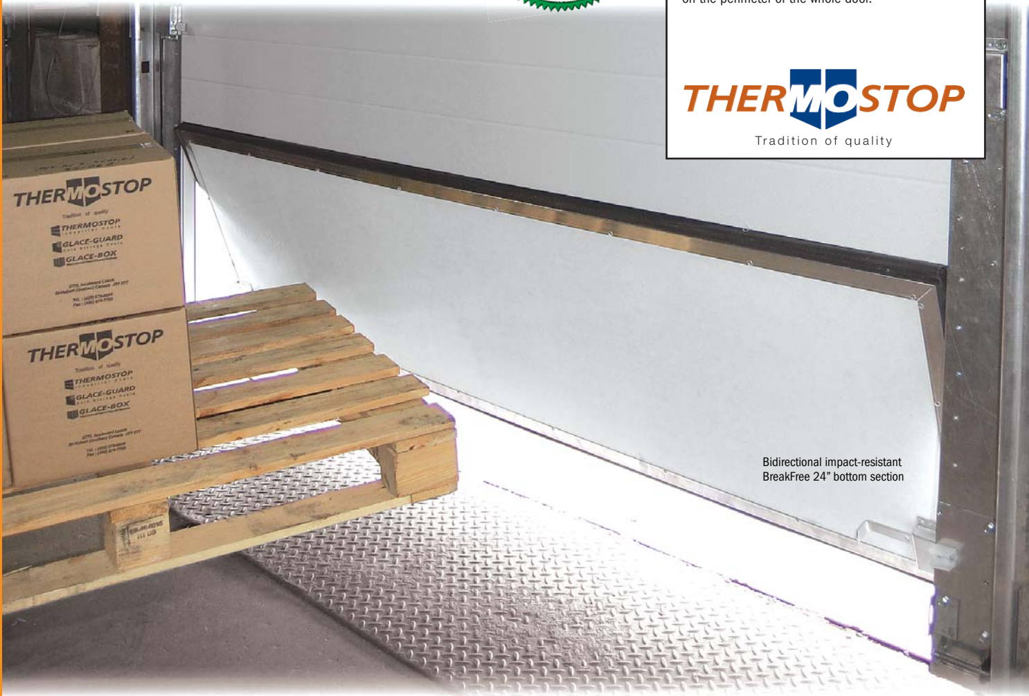
Bidirectional impact-resistant BreakFree 24" bottom section