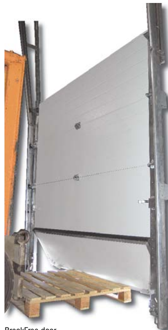
BreakFree door hit from the inside