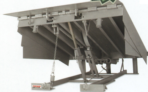
CM Series 6' x 8' 25,000 CIR with CleanSweep Frame™ and Full Range Toe Guards shown.

Periodic maintenance, inspections and clean-up is made easy by adding popular options to your CM Series Leveler. Our CleanSweep Frame™ allows unobstructed access to the pit area. By adding an optional Lip Support Service Strut the lip can be serviced independently of the deck. A permanently mounted, lockout/tagout compliant maintenance strut is standard.