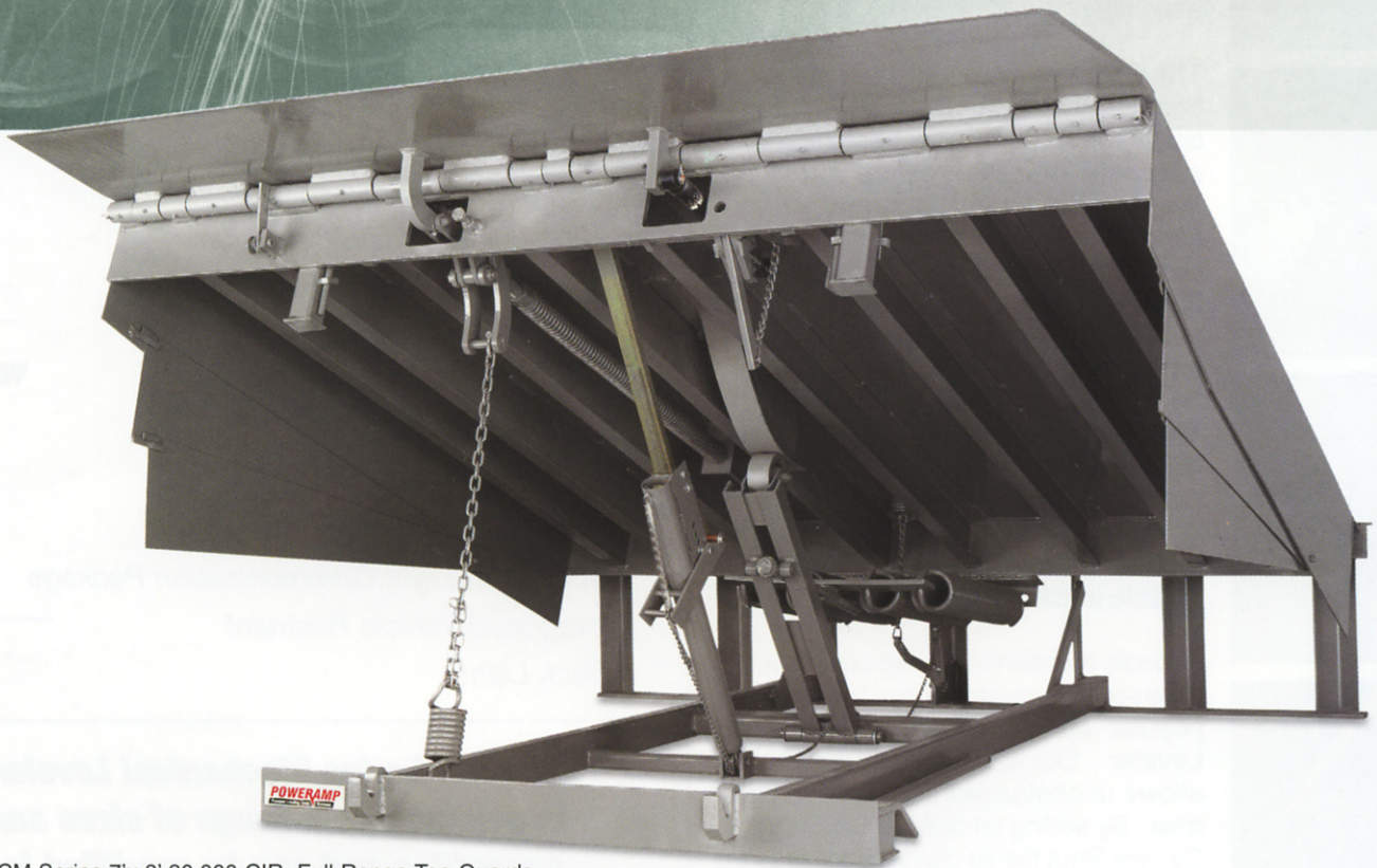
CM Series 7'x 8' 30,000 CIR, Full Range Toe Guards, and Lip Support Service Strut shown.