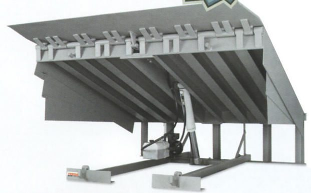
EH Series 7'x 8' 50,000 CIR with CleanSweep Frame shown.

The EH Leveler is powered by a heavy-duty 1.5 horsepower (TEFC) motor. The manifold incorporates a cartridge valve assembly that simplifies field adjustments and improves reliability. A translucent tank facilitates "at a glance" fluid level inspections.