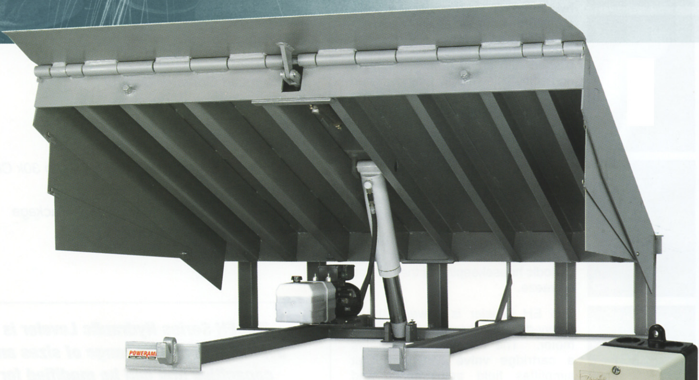
EH Series 7'x 8' 30,000 CIR with CleanSweep Frame shown.