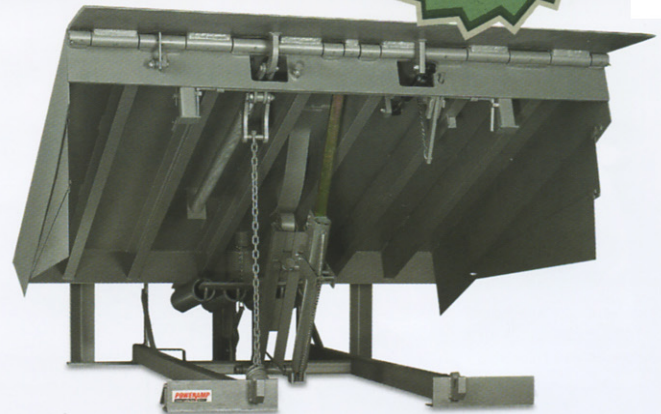
HM Series 6'x 8' 30,000 CIR with CleanSweep Frame™ and Full Range Toe Guards shown.

Periodic maintenance, inspection and clean up is made easy with the HM Series Leveler. Our CleanSweep Frame™ allows unobstructed access to the pit area and is standard on all HM Levelers. The maintenance strut is permanently mounted and lockout/tagout compliant. A separate lip support permits independent support and servicing of the deck and lip.