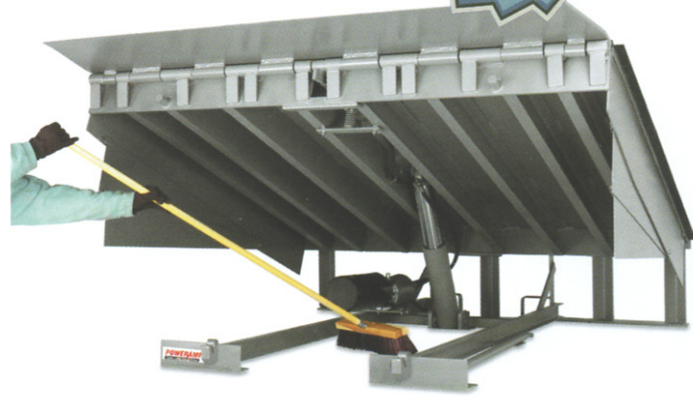
VH Series 7' x 8' 35,000 CIR with CleanSweep Frame™ shown.