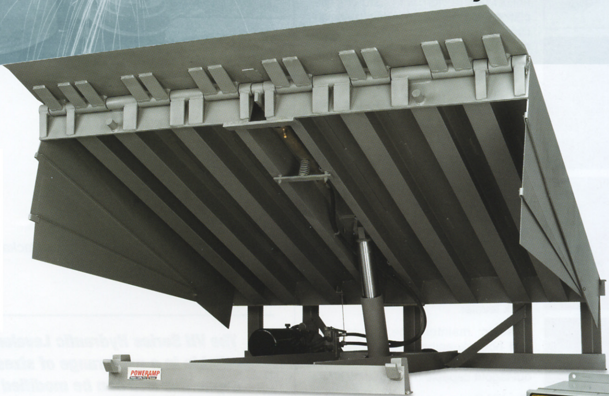
VH Series 7'x 8' 50,000 CIR with Conventional Frame shown.