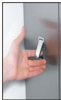
▲ Flush Manual Release

Flush manual release lever opens door in case of power loss.