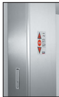
▲ Flush Membrane Switch

Flush manual release lever opens door in case of power loss.