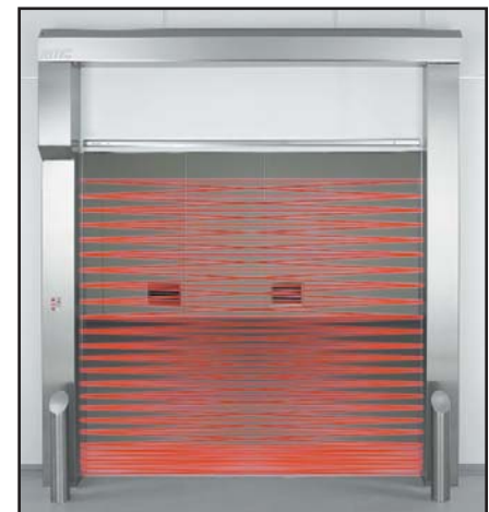
▲ Unique Light Curtain Safety System

Membrane switch allows controls to be remotely mounted.