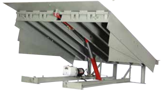
LHP Series 6' x 8' 25,000 CIR shown.

The lip is extended using a fixed but fully yieldable lip cylinder. Hydraulic lip activation provides added assurance of reliable lip extension even where debris or adverse weather conditions are prevalent. The LHP is a cost effective alternative for those considering mechanical or air powered levelers.