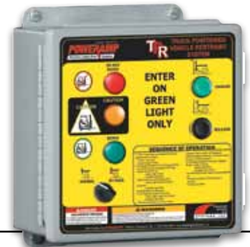
TPR™ shown in with advanced communication controls.